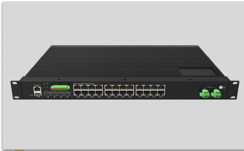
L3 Aggregation Industrial PoE Switch