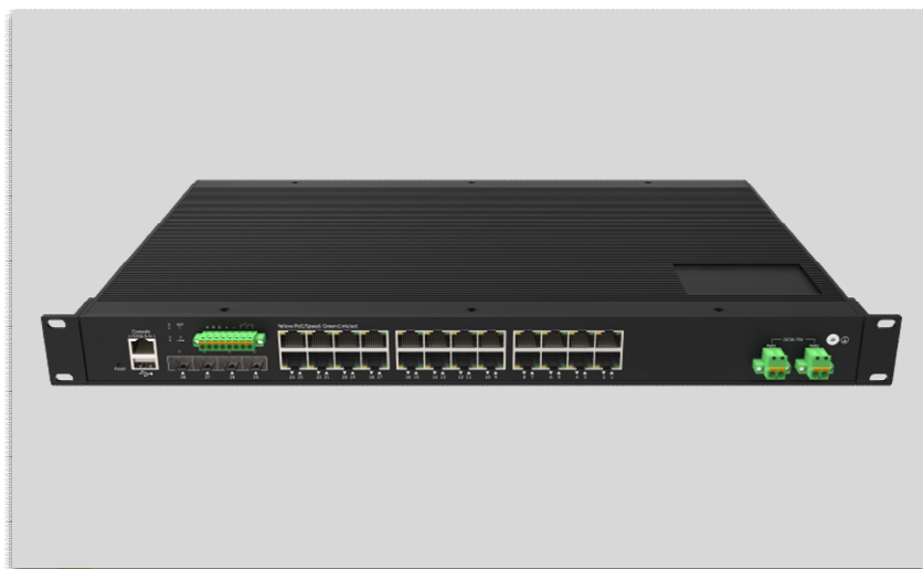
28-port L3 Aggregation Industrial Switch