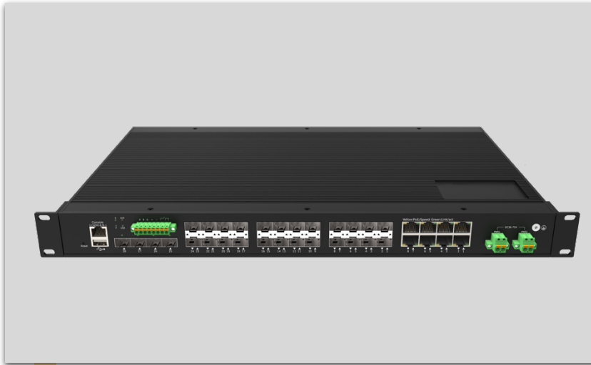
28-port Rack-Mount Industrial Switch