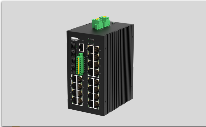
28-port L3 Managed Industrial Switch