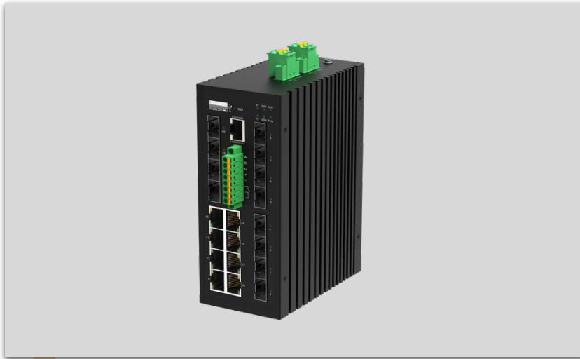
20-port Managed Industrial Switch