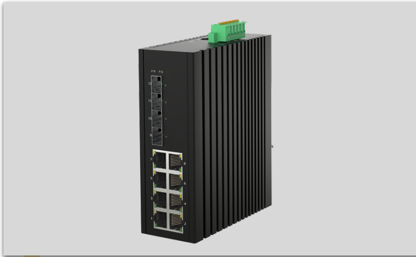
12-port Managed Industrial Switch