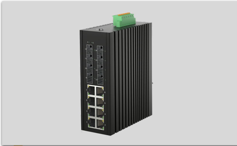
16-port Managed Industrial Switch