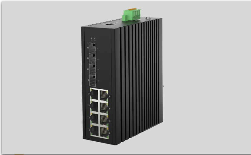
12-port Managed Industrial Switch