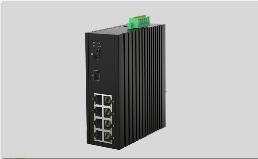
10-port Managed Industrial Switch