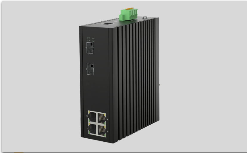
6-port Enhanced Industrial Switch