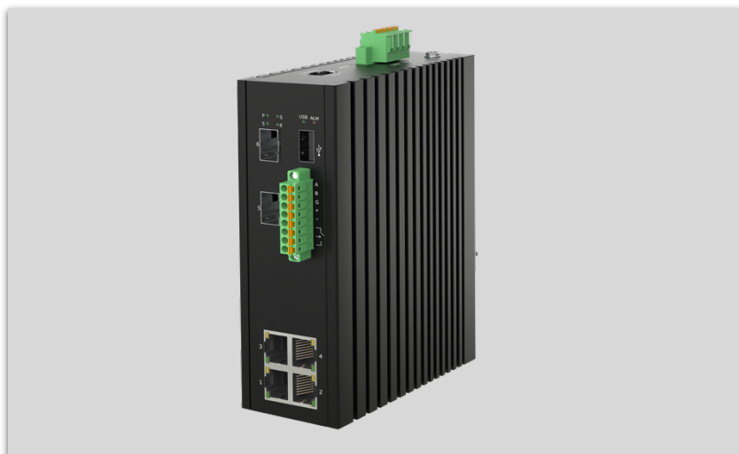
6-port Enhanced Industrial Switch