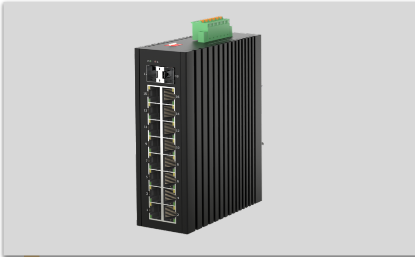
18-port Unmanaged Industrial Switch