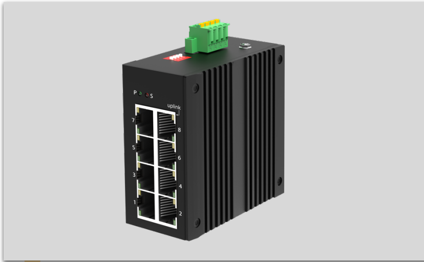
8-port Unmanaged Industrial Switch