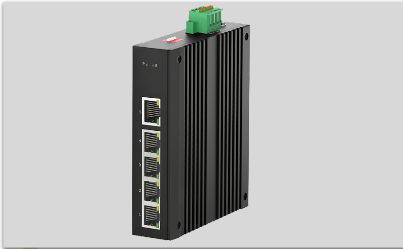
5-port Unmanaged Industrial PoE Switch